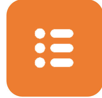
List Your Products