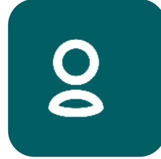
Create Your Profile

Our exhibitors can manage all promotion and preparation processes from a single digital platform. Through the exhibitor portal, they can create their profile pages on web & mobile platforms, add information, videos, photos about their products, follow and respond to B2B calls and receive requests for venue services.