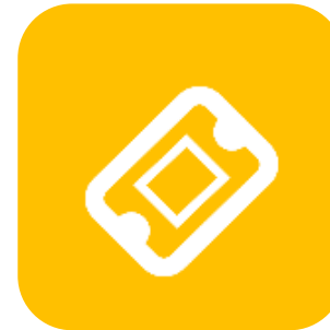
Request Venue Services