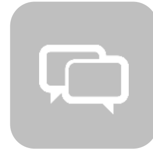
Manage B2B Meetings